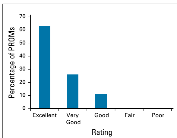
FIG 2. Self-reported adherence to oral oncolytics taken across the sample of patients. PROM, patient-reported outcome measure.

There are several limitations to this study. First, it was conducted at a single practice and results may not be generalizable to other oncology practices. In addition, given the lack of clear communication of the PROM to the provider, it is unclear how the patients completed the document and whether symptoms were truly current versus something the patient previously experienced. A provider-